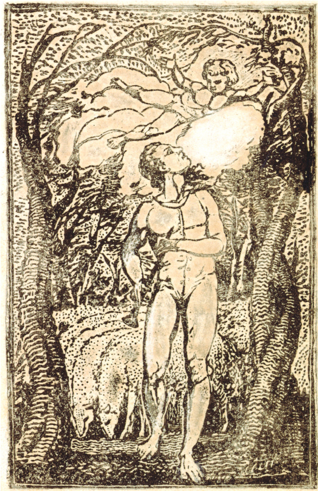
2. Frontispiece, Songs of Innocence copy U (composed and printed 1789). 11.0 x 7.0 cm. Houghton Library, Harvard University. Typ 6500.34u.